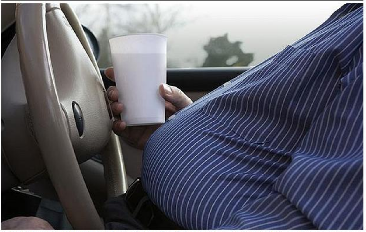
Government statistics show that more than 60 per cent of adults in England and a third of 10 and 11-year-olds are obese

Ministers are failing to act on the national obesity crisis and industry is not taking enough action to label calorie-content on menus, it has been warned.